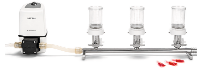
Microsart® Manifold with Biosart® 100 Monitors and Microsart® e.jet Pump (Pump and Monitors are not included in the delivery content)