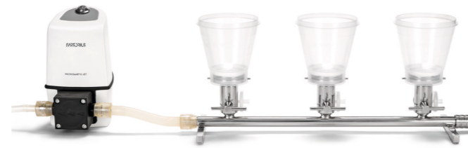
Microsart® Manifold with Biosart 250 Funnels and Microsart® e.jet Pump (Pump and Funnels are not included in the delivery content)