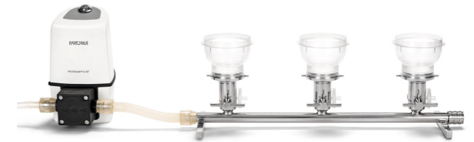
Microsart® Manifold with 100 ml Microsart® Funnels and Microsart® e.jet Pump (Pump and Funnels are not included in the delivery content)