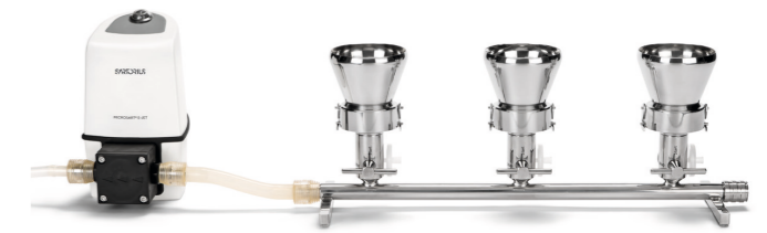
Microsart® Manifold with 100 ml Stainless Steel Funnels and Microsart® e.jet Pump (Pump is not included in the delivery content)